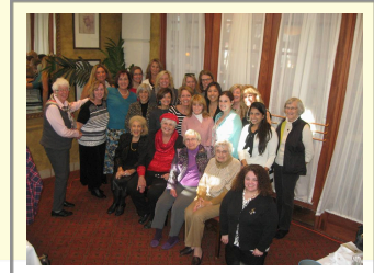
Tri Delta Cleveland Alumnae Founders' Day November 2015