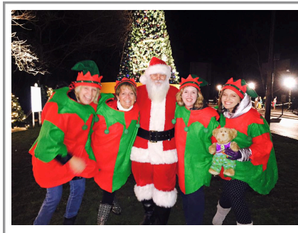
Cuyahoga Valley Polar Express "Elf Yourself" December 2015