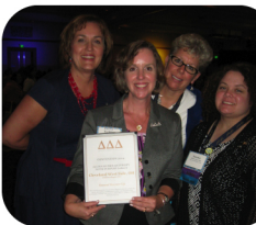
Convention attendees with our award for Alumnae Philanthropy with Purpose (other charity) 2 nd Runner Up for a medium-sized chapter.